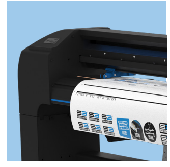
SENSOR The larger roll cutters contain an extra sensor, keeping your sheet media as secure as possible.