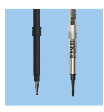
EXTRA TOOLS The Performance Head comes with 2 extra tools: a creasing tool and a fibre pen.