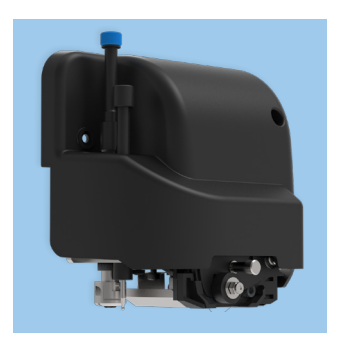
PERFORMANCE HEAD The Performance Head with OPOS Cam has been designed with an extra tool holder slot. That way you can cut and crease/draw during the same job.

CONNECTIVITY In Europe, the US and Canada it is now possible to connect via Wi-Fi, as well as via USB and ethernet.