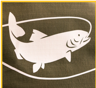
CAD-CUT® Heat Transfer Vinyl